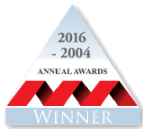
M&A Advisor Awards

FT Partners has been recognized as Investment Banking Firm of the Year and regularly achieves Merger and Financing Deal of the Year recognition